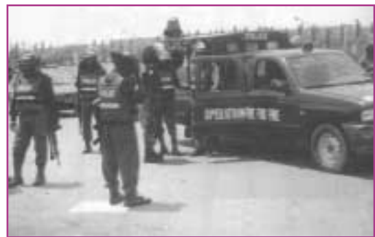
Officers and men of the Nigeria Police on duty

In Nigeria, members of the police organization are not detached from their traditional background no matter the training and orientation received in the police. As a matter of fact, the training received in the police colleges and academy could surreptitiously reinforce their domestic violence behaviours.