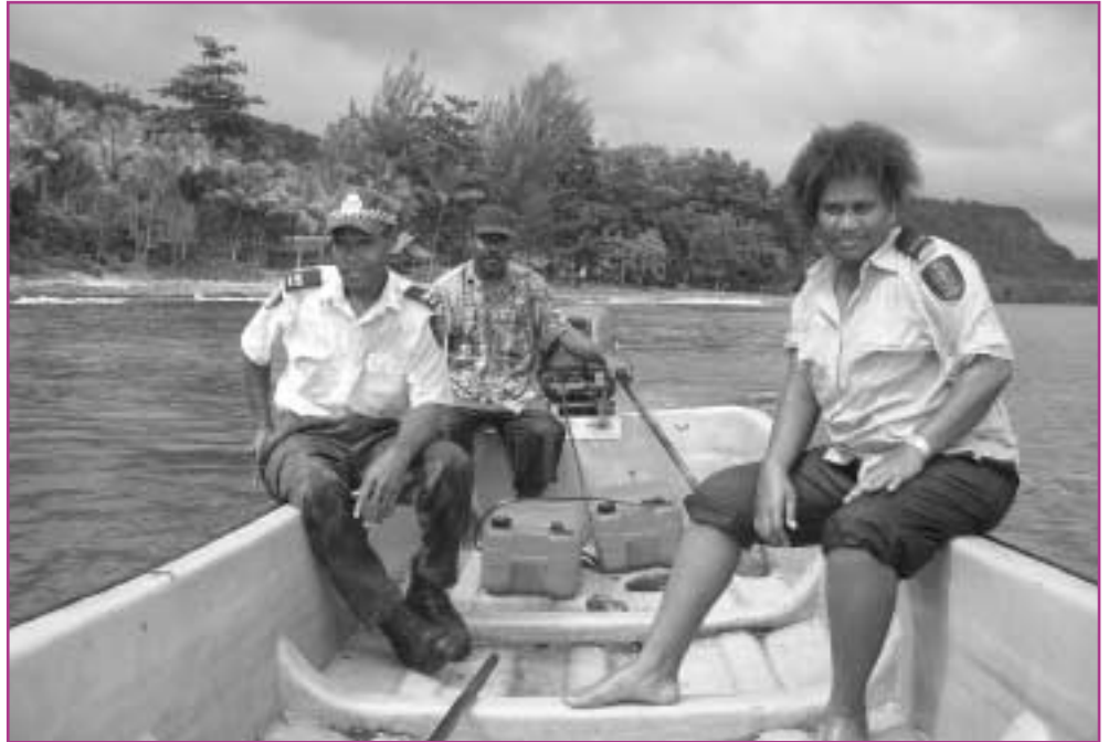
Royal Solomon Islands Police on patrol