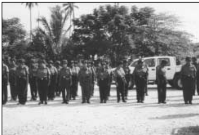
6th National Police Women's Conference At Rabaul 2001