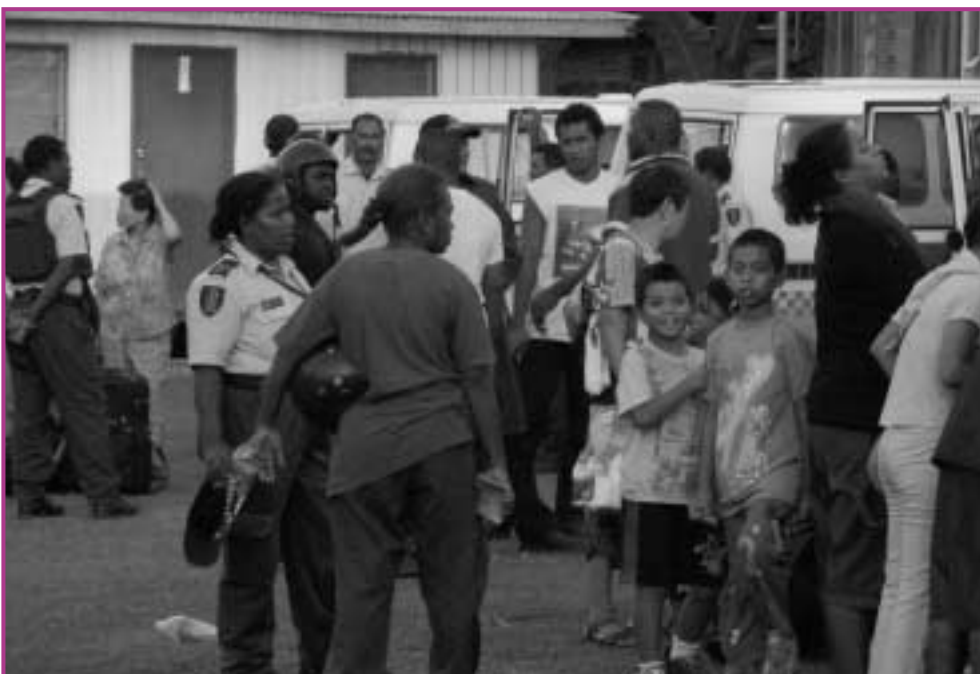
Royal Solomon Islands Police assisting members of the affected Asian community during the Honiara riots, April 2006