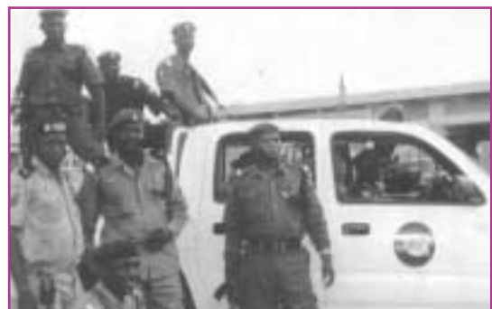
Nigerian Police: Preparing for operation

As noted earlier, the aim of this study is to expand the existing knowledge on domestic violence most especially as it affects the police. Other than this, this study would investigate domestic violence among the police using some social variables as indices of measurement.