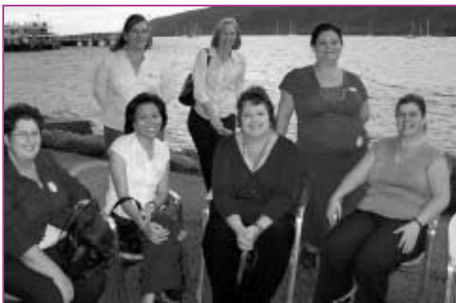
Some of the staff and student social workers from Cairns Regional Domestic Violence Service and the Womens Centre Cairns before the ceremony.