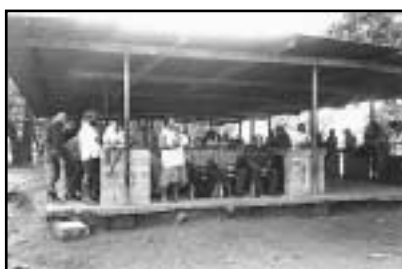
Community policing meeting at Sogeri NCD Officers at Action Planning Conference

For many senior managers the inclusion of community policing into general duties policing was a new direction for policing, and it was encouraging to see the support that developed from grass-roots communities when they were consulted with, especially from women