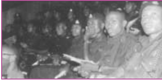
Cross section of the officers and men of the Nigeria Police

violence among the police. It goes without saying that this (paucity of literature) has placed a major limitation on the current study. This notwithstanding, we are convinced that this study has significantly contributed to knowledge.