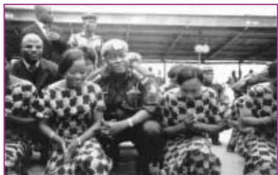
Some members of Police Officers Wives' Association (POWA)