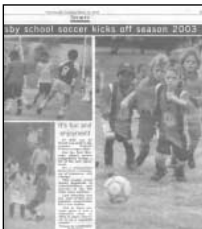
School Soccer Competition