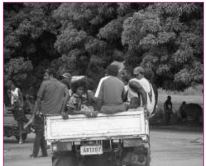
Locals driving around Honiara