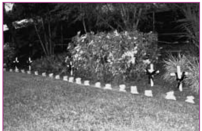
The crosses and candles illuminating the Hilton Cairns waterfront gardens.